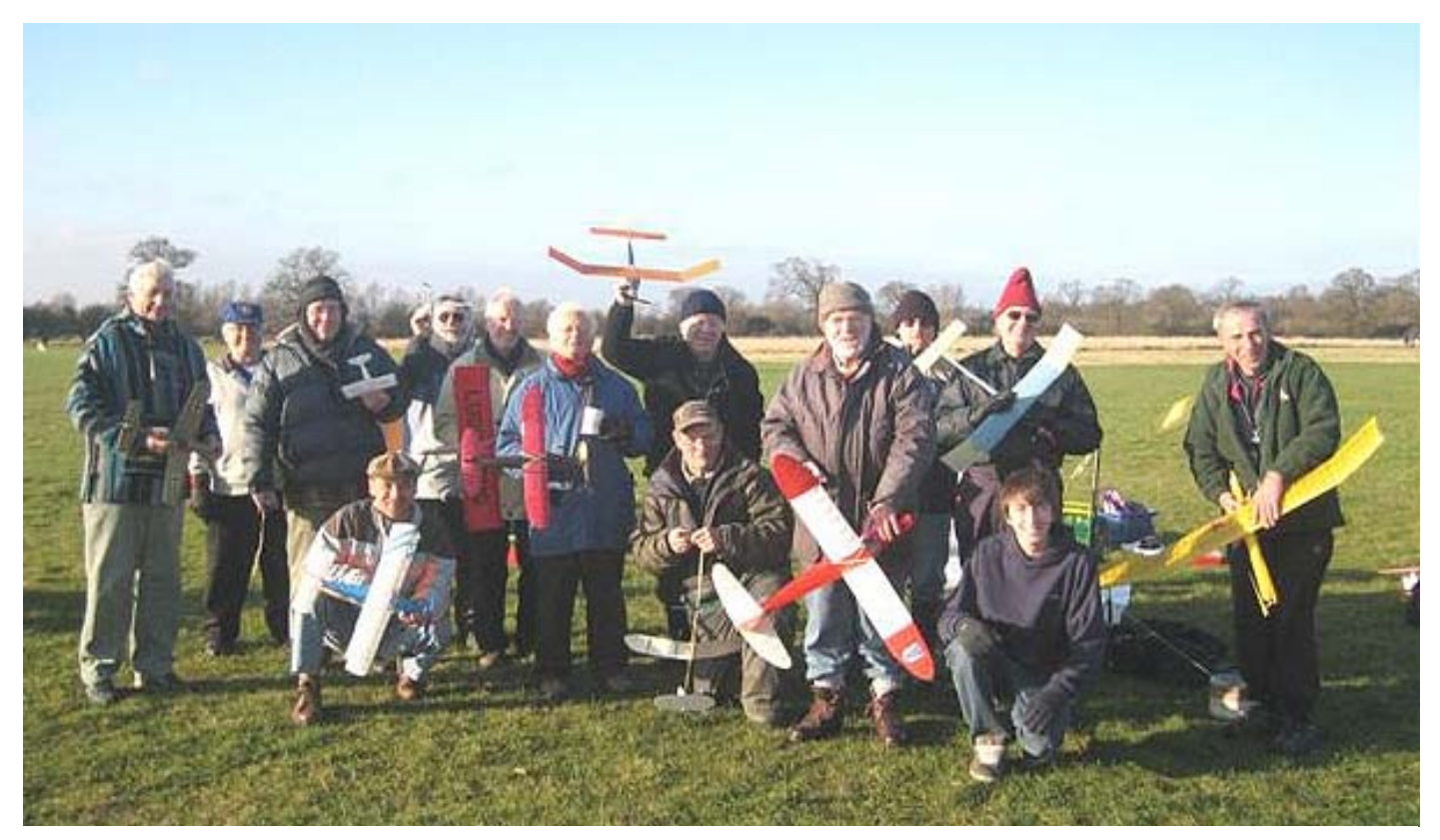
The Frost-Free-Fun-Flying-Fraternity-Frolicing-Freely-at-Ferry. (Frost-Free-but-COLD)