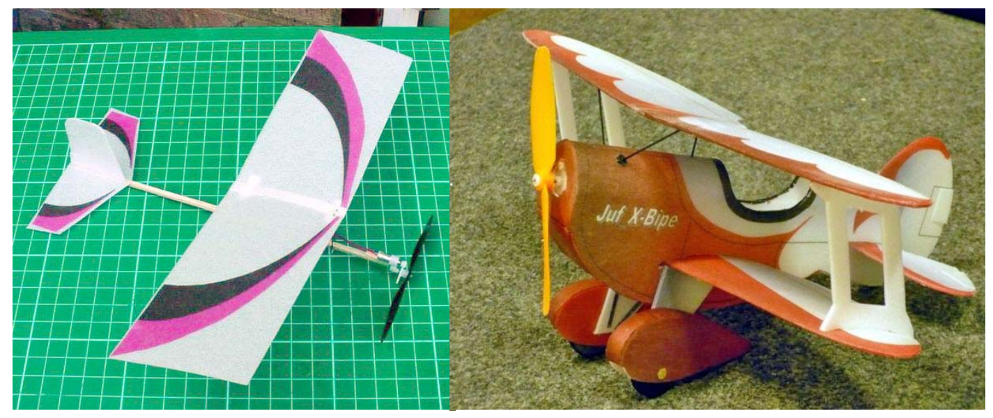
Here is 'Bump', the model he has been experimenting with.

His thread on electric Indoor flying has had over 6000 hits (6218 as of today 16th Feb), so it's a popular thread and very interesting. There is a wealth of information on every aspect of flying Indoor electric and Ian has the ability to write clearly and comprehensively about it. Highly recommended.