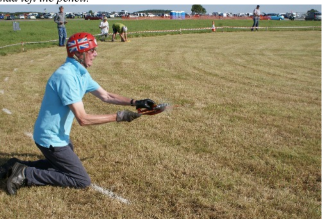
BUT... (See over...)