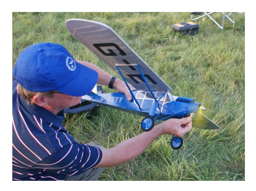
Gareth with D.H. 75 Hawk Moth. Built for such flying only events as this but worthy of Open scale participation.