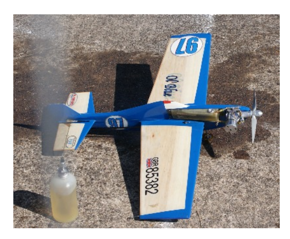
(To page 13)

Those noisy boys, BL and BVW were at it again. Despite being "occasional" flyers in British Goodyear, they put in a highly competent display notable for excellent teamwork by Lever even when an unexpected extra pitstop was required. It had cost them only three laps, so they qualified for a Monday final.