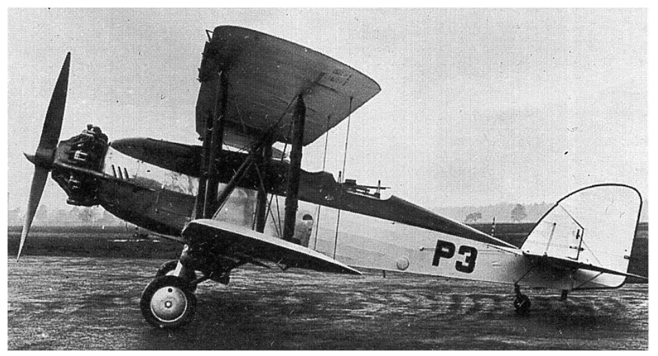
The Westland PV-3 aircraft used for the expedition.

We nearly lost our cameraman, as the essential pipe in his oxygen mask burst at a high altitude. He survived, but was later killed while photographing an air raid on London. The film record of the mountaineering conquest of Everest in 1953 was brilliantly photographed by Tom Stobart, whose material was subsequently made into a film financed by the National Film Finance Corporation with which I was then identified, and a prized possession of mine is The Ascent of Everest by John Hunt, autographed by every member of the expedition.