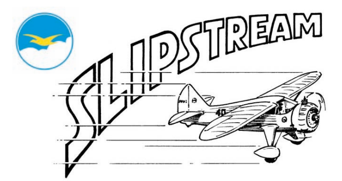
BULLETIN OF THE AUCKLAND MODEL AERO CLUB INC. EST. 1928 July 2017